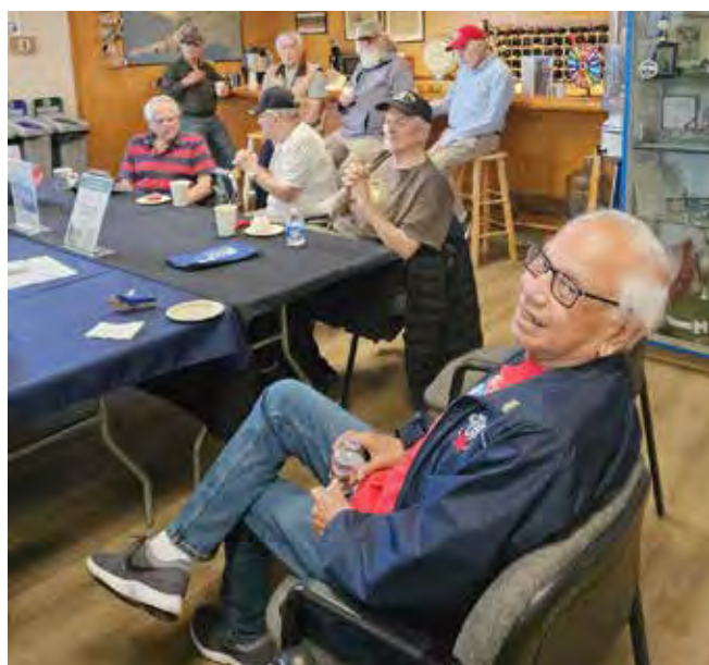
Cloverdale Post 293 Veterans enjoying coffee Wednesday morning with Veterans from Vine Ridge at the Vets Building. All Veterans in the area are welcome.