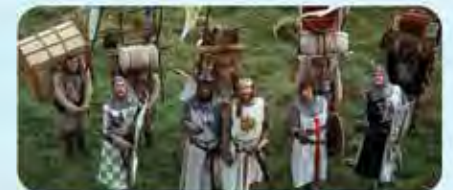
Monty Python and the Holy Grail Wednesday, July 8