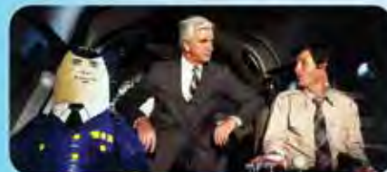
Airplane! Wednesday, July 1

Beat the heat with classic comedies every Wednesday in July.