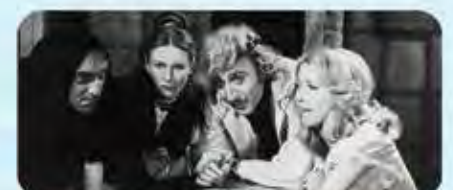
Young Frankenstein Wednesday, July 22