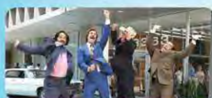
Anchorman: The Legend of Ron Burgundy Wednesday, July 29