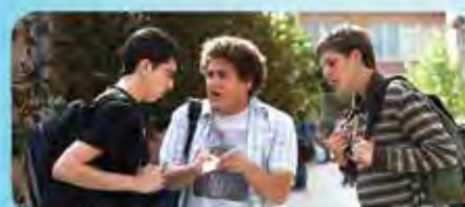
Superbad Wednesday, July 15