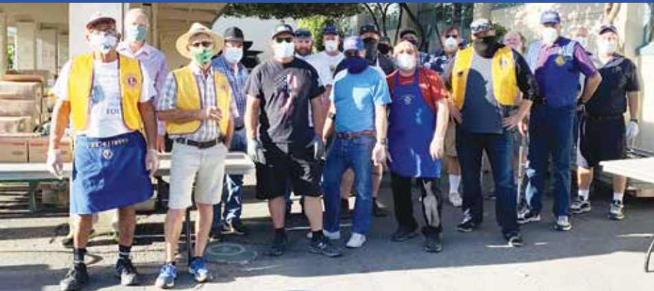
The Cloverdale Lions getting ready to serve FREE drive-thru Father's Day breakfast, co-sponsored by the Citrus Fairgrounds.