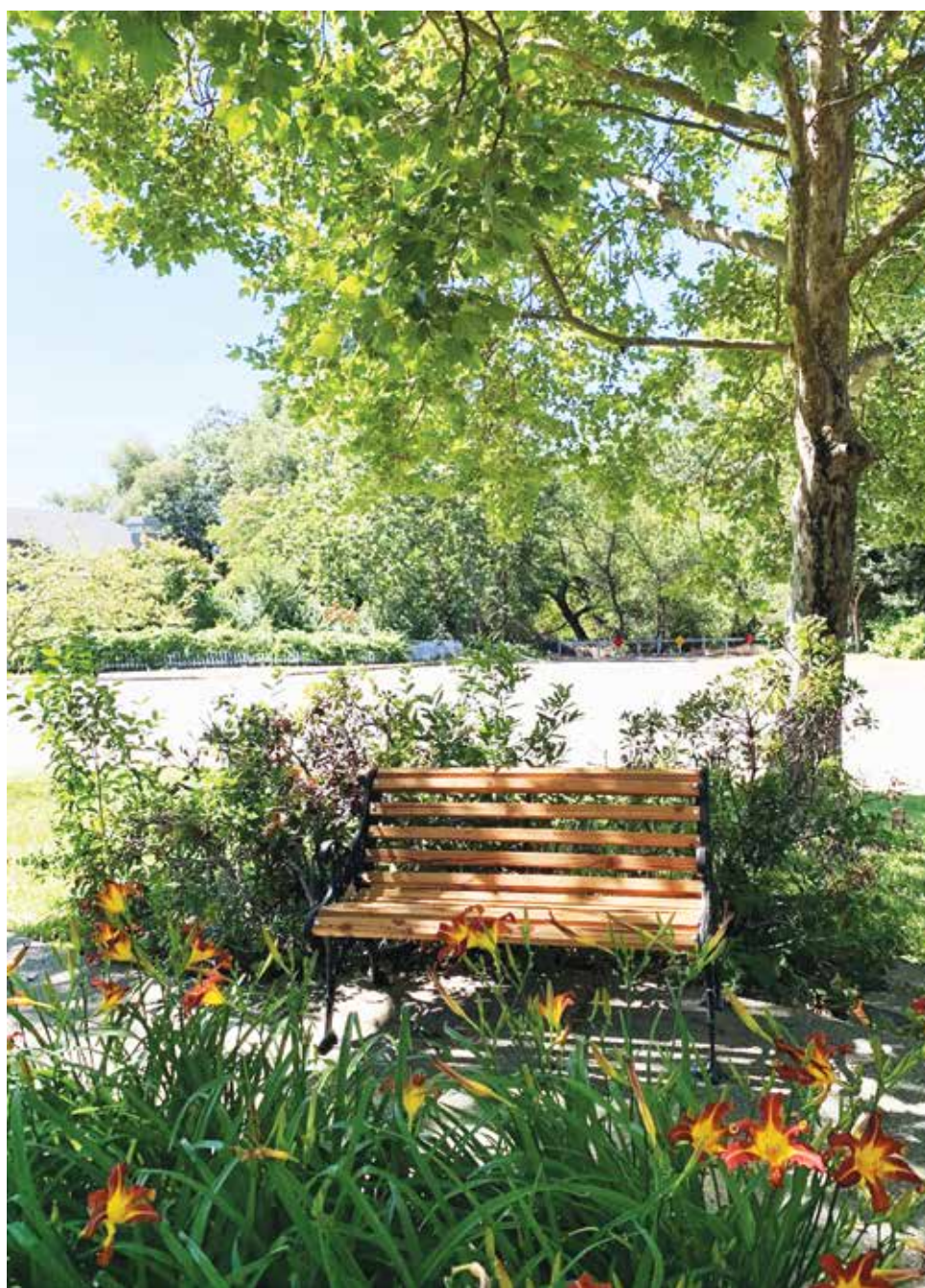
Newly refurbished benches in the pocket park at the end of Chablis Way – nice job!

Thank our local Cloverdale retailers and use: #IndependentRetailerMonth to share on social media.