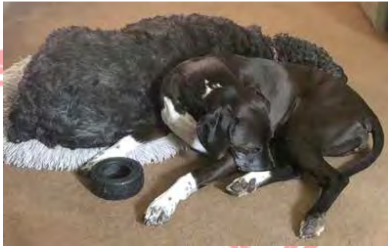
Zsa Zsa & Shiloh