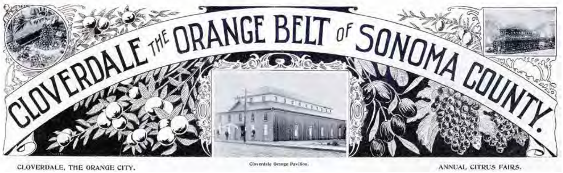
CLOVERDALE, THE ORANGE CITY.