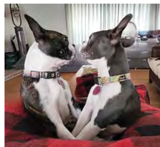
Little Miss & Bullet