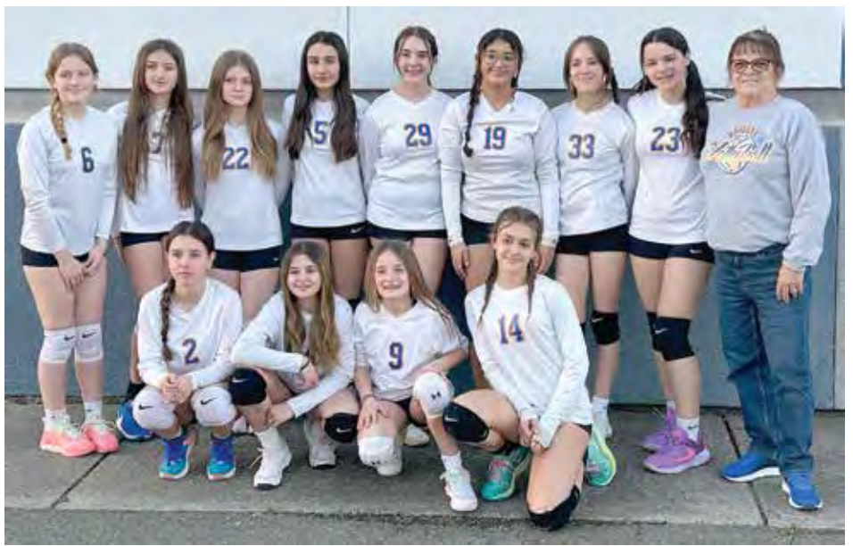
7th Grade Volleyball Roster 2024-2025