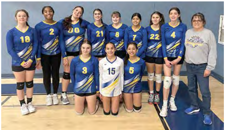
8th Grade Volleyball Roster 2024-2025