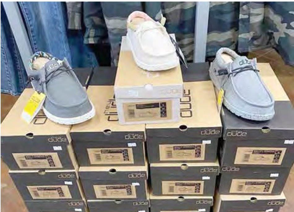
Dudes have started arriving at The Outpost . Limited inventory so don't wait. Next availability, because of inventory issues, is March.

Happy New Year Everyone. May yours be a prosperous and amazing 2022!