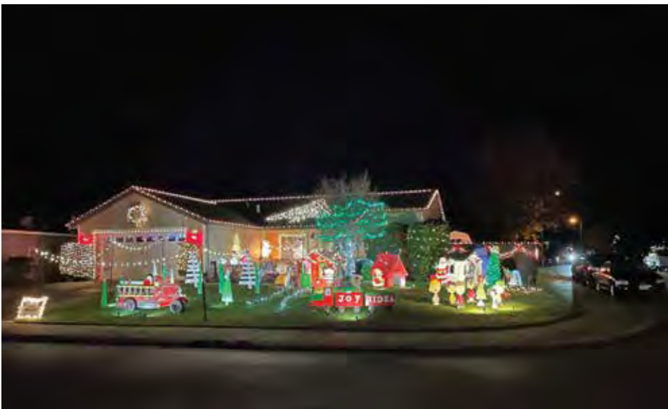
Congratulations to the Snyder family, winner of the Cloverdale Lights and Display contest for 2021.

Looking for somewhere local to donate clothing and household goods? Please consider the Heaven's Closet Thrift Store at the "ivy" church, located on Cloverdale Boulevard.