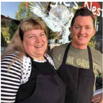
MOE'S EAGLE'S NEST DELI BUILD IT, GRILL IT, EAT IT. GREAT COMFORT FOOD BROUGHT TO YOU BY MOE AND JEFF WITH THEIR ALL-NATURAL INGREDIENTS.