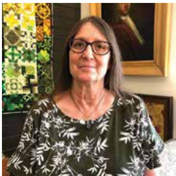
BOLT FABRIC + HOME KATE HAS A UNIQUE SELECTION OF QUALITY QUILTING FABRICS AND STYLISH HOME ACCESSORIES. IT'S A MUST-STOP-SHOP!