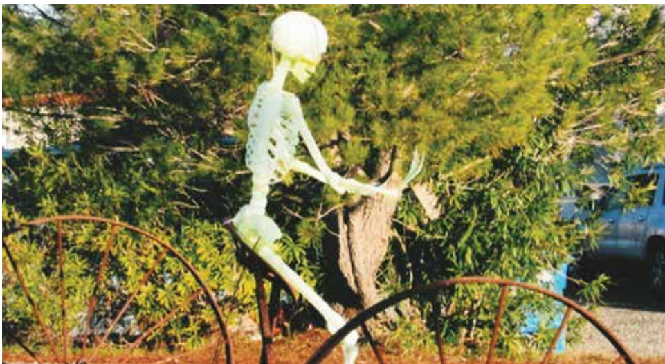
Submitted by Gary Murray