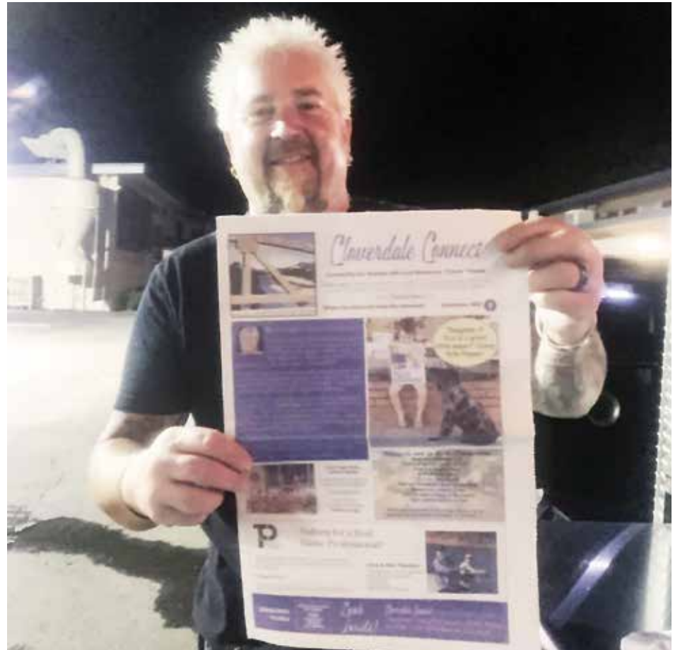
Peace, love and Cloverdale Connect put the shama lama in ding dong! Thanks Guy Fieri for supporting the CHS Culinary Arts!

Wildfires, smoky skies, distance learning, continued isolation, COVID 19, upcoming elections - all severe stress factors and yet we are blessed to live in such a beautiful area with such a strong sense of community - as the slogan says: "Sonoma Strong". We will get through this. The goal of Cloverdale Connect is to keep us connected through these challenging times as we stay united to come out the other side. In the meantime, there are people in our community engaged in tremendous relief programs providing food and resources to anyone in need. Our local businesses are working hard to continue to provide the same level of service they are known for and maintain a semblance of life as usual. Please continue to support our generous Cloverdale non-profits and also keep your spending in town at our local businesses that depend on us now more than ever. I look forward to us all gathering in the future at our great community events like the Citrus Fair, Friday Night Live, the Car Show and more. Cloverdale is a remarkable community situated "where the vineyards meet the redwoods" and Cloverdale Connect is here to celebrate all that is good in our community now and in our bright future. I'll see you around town!